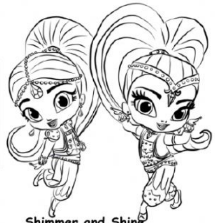
Shimmer and Shine

6. She is small. She's got short brown hair and big brown eyes. Her head is big but her body is small. She's wearing and orange T-shirt and pink shorts. Her name is _____.