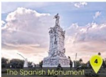
4 The Spanish Monument

Then turn right on Avenida Sarmiento and head over to the Galileo Galilei planetarium. There, you can see a piece of rock from the moon. There's a telescope you can look at the sky through, too.