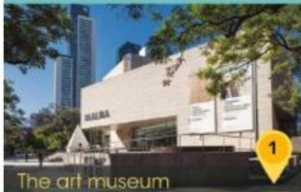
1 The art museum

Why not start at MALBA, the art museum on Avenida Figuero Alcorta? There are some fantastic sculptures and paintings there.