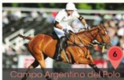
6 Campo Argentino del Polo

Turn right to see another big statue. That's the statue of Domingo Faustino Sarmiento. He was a writer and a president of Argentina. Auguste Rodin, a famous French artist, made the statue.