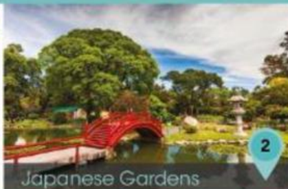
2 Japanese Gardens

Why not start at MALBA, the art museum on Avenida Figuero Alcorta? There are some fantastic sculptures and paintings there.