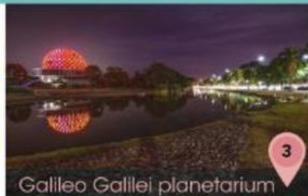
3 Galileo Galilei planetarium

Next, walk up to the park, turn left, and get a taste of Japan in Argentina. You can visit the Japanese Gardens and see about 150 different types of plants from Japan. Don't forget to taste some Japanese tea before you leave.