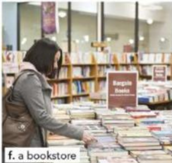
f. a bookstore