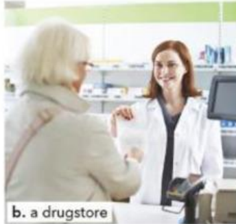
b. a drugstore