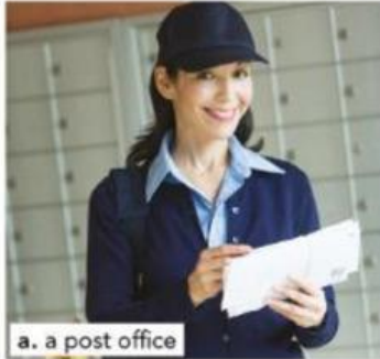
a. a post office

"You can buy a backpack at a department store."