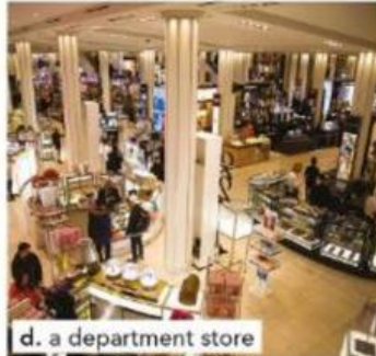
d. a department store