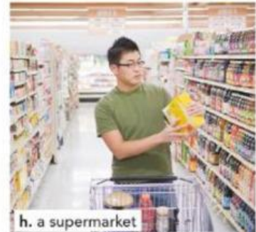
h. a supermarket