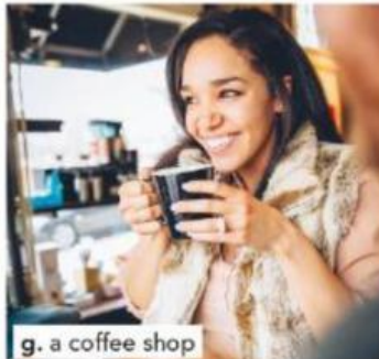
g. a coffee shop