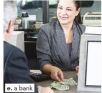
e. a bank