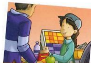
work in the cafeteria ✗