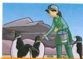
feed the penguins ✓