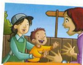
help a lost child ✓