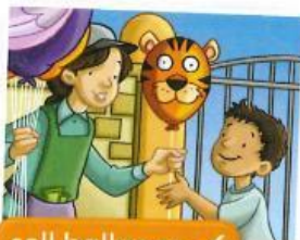
sell balloons ✓