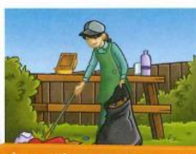
clean the picnic area ✗