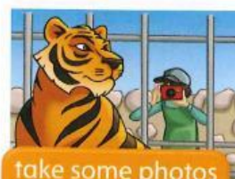
take some photos for the website ✓