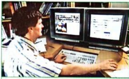
use the Internet