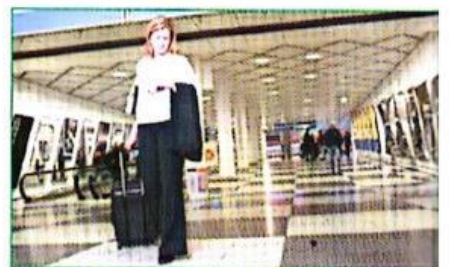
take business trips