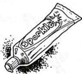
1 a tube of toothpaste

a bag of a bar of a bottle of a box of a bunch of a carton of a dozen a jar of a loaf of a packet of a pot of a roll of a tin of a tub of a tube of