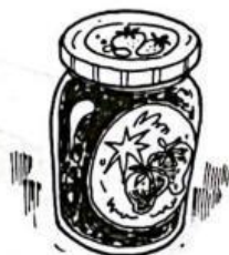
2 _____ jam