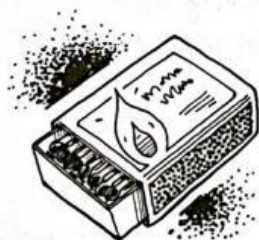
7 _____ matches