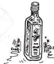
6 _____ olive oil