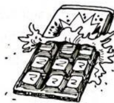
8 _____ chocolate