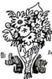
4 _____ flowers