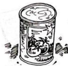
3 _____ tomatoes