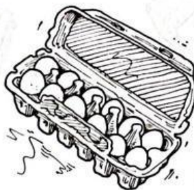
5 _____ eggs