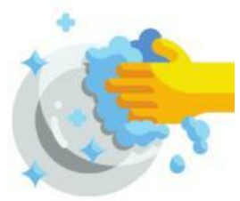
DOING THE DISHES