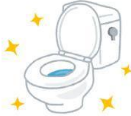
CLEANING THE BATHROOM