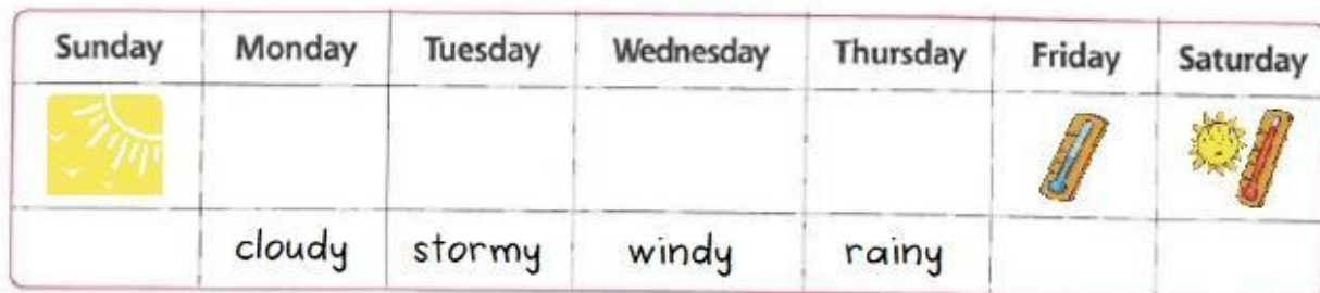
The Winky Winky weather

1 Draw the symbol or write the weather word.