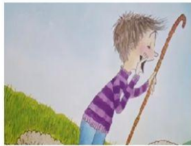
The Boy Who Cried Wolf

There is a time to work and a time to play.