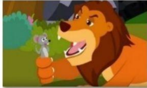
The Lion and the Mouse

Treat others how you would like to be treated.