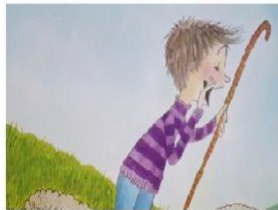
The Boy Who Cried Wolf

There is a time to work and a time to play.