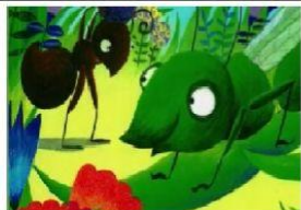
The Ant and the Grasshopper

Slow and steady always gets you where you want to go.