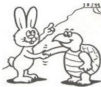
The Tortoise and the Hare

It is important to always tell the truth.