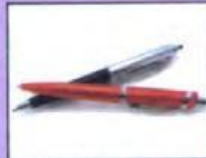
a couple of pens