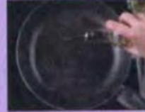
a small quantity of oil