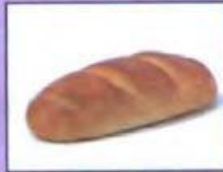
a loaf of bread