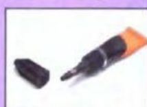
a tube of glue