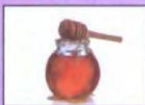
a jar of honey