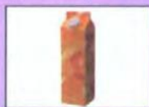
a carton of juice