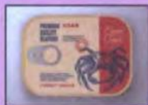
a tin of crab