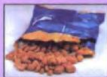
a packet of peanuts