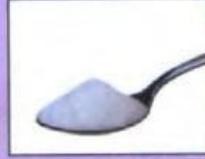
a spoonful of sugar