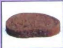
a slice of bread