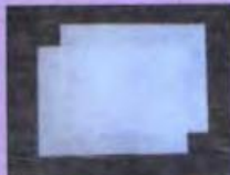
two sheets of paper