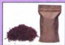
a packet of cocoa powder