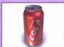
a can of fizzy drink