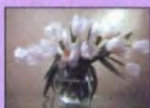
a vase of flowers