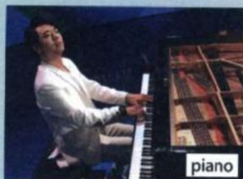
pianist Lang Lang He's playing music by Gershwin.