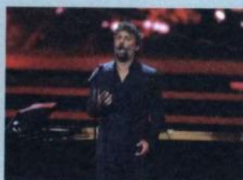
opera singer Jonas Kaufmann is performing.