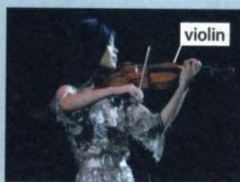
violinist Vanessa Mae She's playing a concerto by Vivaldi.