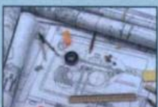
design and technology