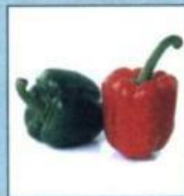
red pepper / green pepper