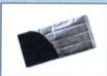
chocolate [U] a bar of chocolate