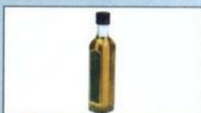
olive oil [U]