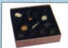
a box of chocolates