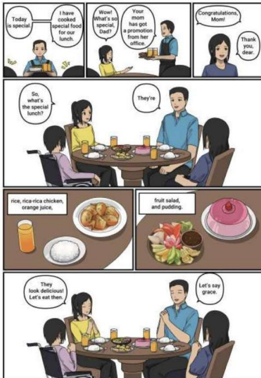
Comic strip 2.2 Part 1 Monita's family lunch

Read the text carefully, Choose TRUE or FALSE the statements!