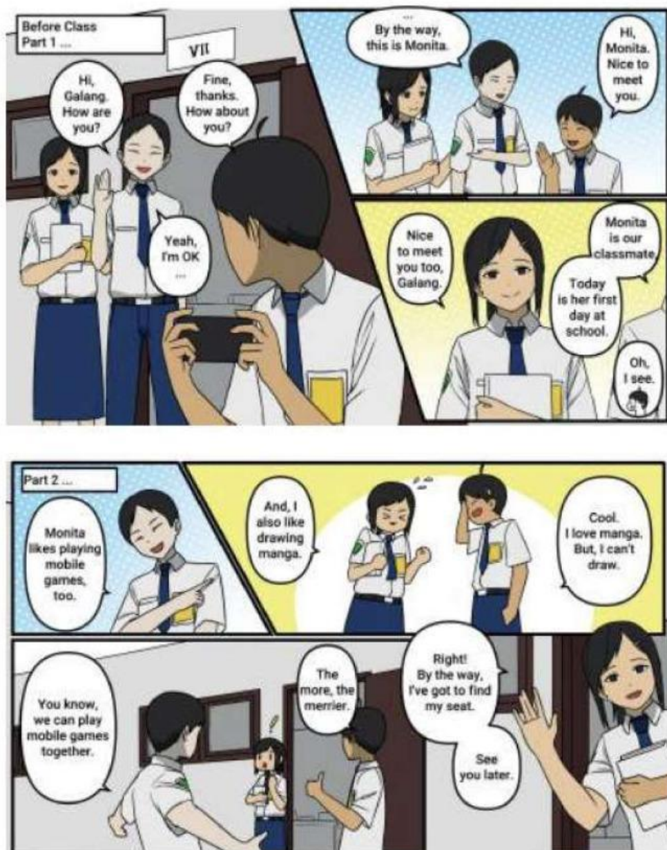
Comic strip 1.4 Three students are introducing themselves

30. Read the text carefully, Choose TRUE or FALSE the statements!