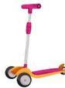
SCOOTER / FOOTER