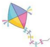
KITE / BIKE