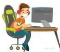
COMPUTER GAME / CAMPUS GAME