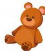
TEDDY / READY