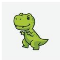
RINOSAUR / DINOSAUR