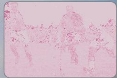
Dhyan Chand of India playing against France in the 1936 Olympic Final

Dhyan Chand, a former Indian hockey player, is considered as one of the world's greatest players. He was a part of the gold winning India team in the 1928 Amsterdam, 1932 Los Angeles and 1936 Berlin Olympics.