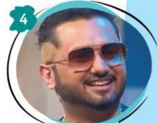
Yo Yo Honey Singh