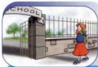
go to school