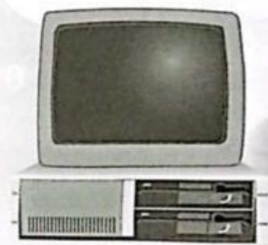
One of the first personal computers (PC).