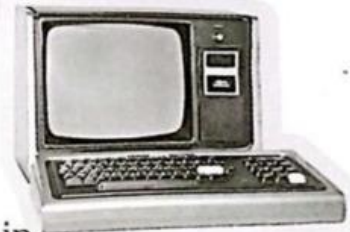
Computer from 1980.

Computers continue to change and develop, connecting people in new and amazing ways. What will computers look like in 50 years?