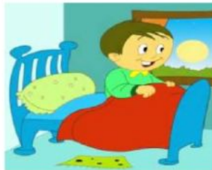
Early to bed, early to rise.