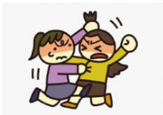
Fighting with others.