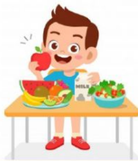
Eating healthy food .