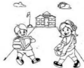
Grade 1 pupils going to school.