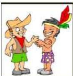
playing with friends