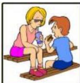
going for a picnic