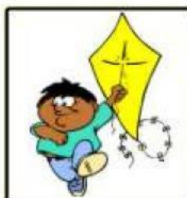
flying a kite