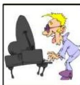
playing the piano