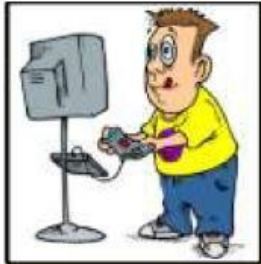
playing video games