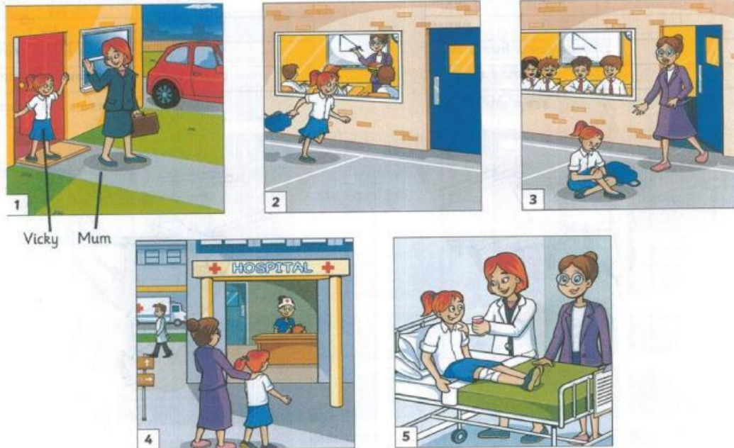
Vicky's strange day

Vicky's mom is a doctor. She's saying to Vicky, 'I've got to go to _____. Be quick, you're late for _____'.