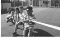
4 child →