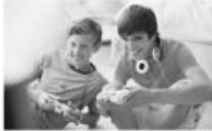
2 boy →