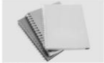
1 notebook →