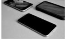
5 phone →