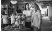
3 woman →