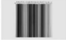
6 pencil →