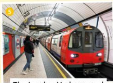
The London Underground