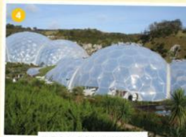
The Eden Project