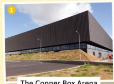
The Copper Box Arena