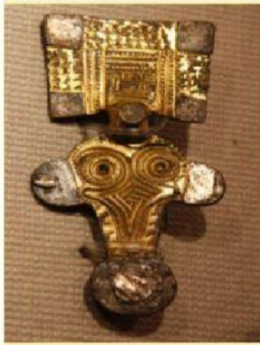
The Milton Jewel Brooch