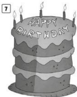
7 a _____ cake