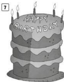
a _____ cake