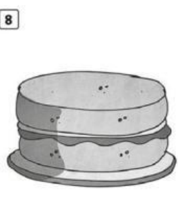
8 an _____ cake

2 Read the text. Which of the four teenagers sometimes tries to copy the appearance of famous people?