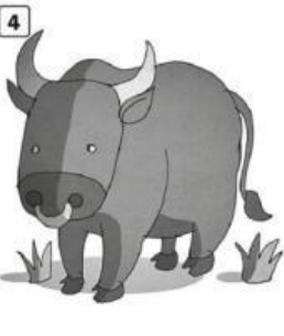
4 a _____ animal