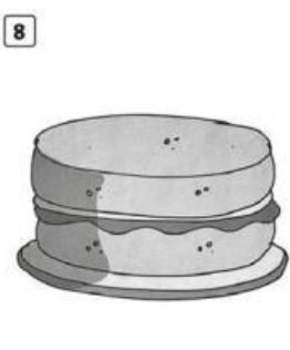
an _____ cake