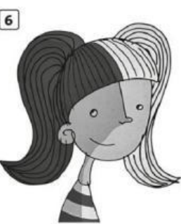
6 _____ hair colour