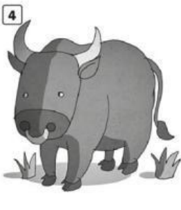
a _____ animal