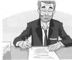
7 mathematician / writer