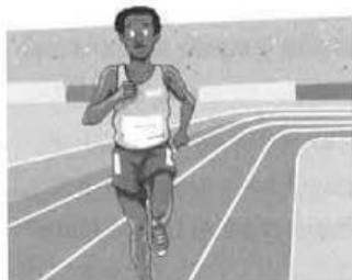
1 athlete / surgeon

1 Look at the pictures and circle the correct options.