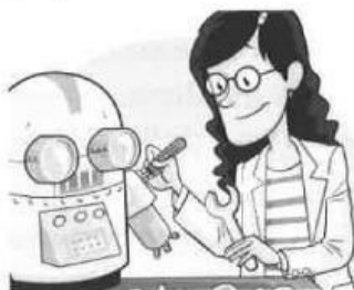
2 inventor / composer