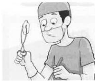
3 surgeon / writer