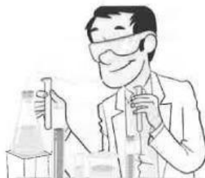
5 athlete / scientist