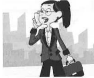
8 businesswoman / athlete

2 Put the letters in bold in the correct order to make words for qualities.