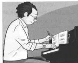
6 composer / writer