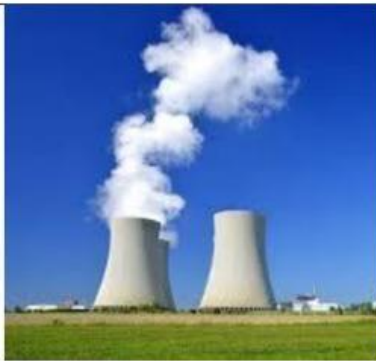
Nuclear Power Plant