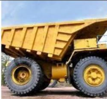
Mining dump trucks