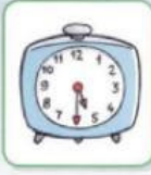
half past five