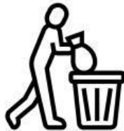
..... throw out