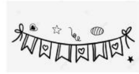
..... decoration (s)