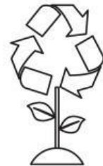
..... recycling plant