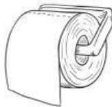
..... toilet paper roll