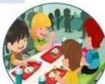
My friends and I