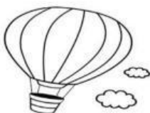
Flying in a hot-air baloon