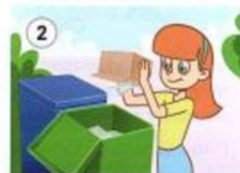
2 She _____.