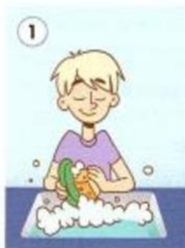
1 He _____.

5 Name the jobs these children did at home in the past.