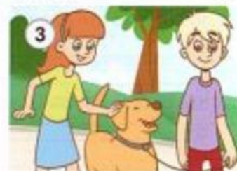
3 They _____.