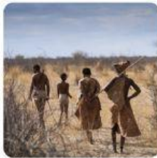
First modern humans

Arrange the following events chronologically (starting with the earliest and following the order in which they happened).