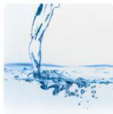
First liquid water