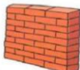
wall / door