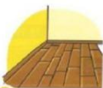
floor / roof