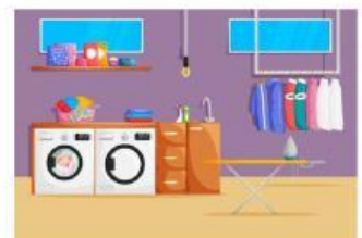
basement / attic