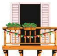
window / balcony