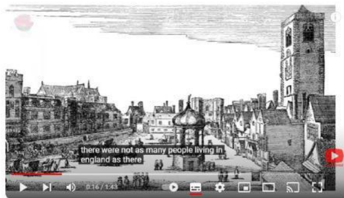
London: Past and Present