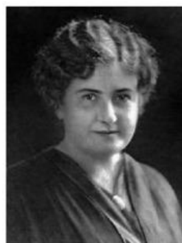
Simone de Beauvoir