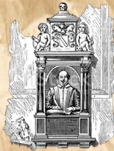
Shakespeare's monument in Stratford Church