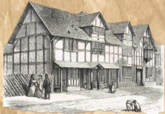
Shakespeare's house in Stratford-upon-Avon