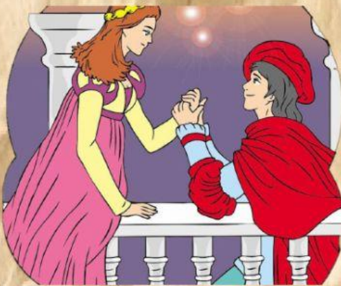
Romeo and Juliet at a balcony.

Many years ago in Verona, Italy, there were two families: the Capulets and the Montagues. These families were always fighting. The Montagues have a son, Romeo. The Capulets have a daughter, Juliet. Romeo met Juliet and they fell in love. They decided to get married, but they knew that their families would be very angry. After some fights, the Prince of Verona exiled Romeo out of the city. Juliet drank a substance similar to a poison, to pretend to be dead, so she could meet Romeo later. Romeo didn't get the message about the plot, drank a real poison and he died. When Juliet woke up, and knew about the death of her lover, she committed suicide too.