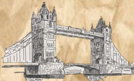
Tower Bridge in London.

Before 1590 he left Stratford and went to London, the capital city of England. There, he worked as an actor in an acting company. These companies were formed by around ten actors, where young boys played women's roles because women couldn't act in plays. He also began to write plays. In 1593 the plague killed thousand of people and theatres were closed, so he started to write sonnets (a kind of short poems).