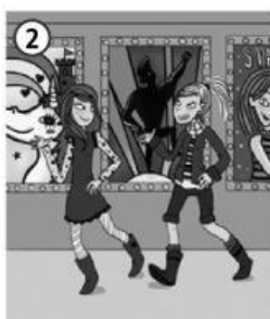
go to the