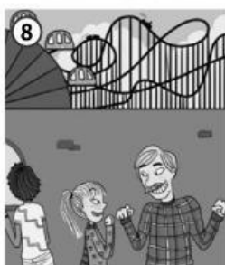
go to a