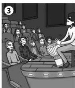
go to a