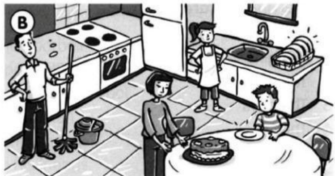
In Picture B ...