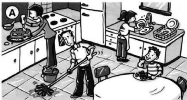
In Picture A ...