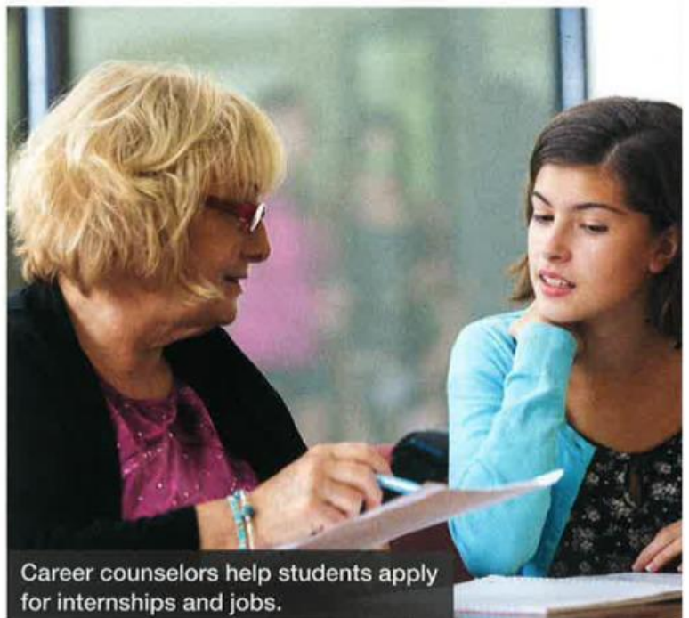
Career counselors help students apply for internships and jobs.

Many college students 1 _____ (take) a semester off from school if they want 2 _____ (get) some work experience. They often prefer 3 _____ (find) internships in the types of companies or organizations that they hope 4 _____ (work) for after they finish college. This way, they can learn more about the industry and find out if they'll enjoy 5 _____ (work) in that field in the future. Most students shouldn't expect 6 _____ (get) paid if they find an internship. However, even if an internship is unpaid, students should still consider 7 _____ (do) it. The work experience gained will increase their chances of getting a permanent job in the future, and make the job search process less stressful.