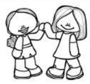
using nice words