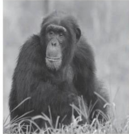
▲ a chimpanzee

And, of course, many animals communicate with sounds. Birds use their beautiful songs to communicate. Dogs, cats, and people all make different kinds of sounds to send many different messages.