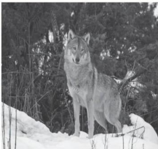
▲ a wolf