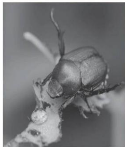
▲ an insect