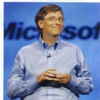
Bill Gates, businessman