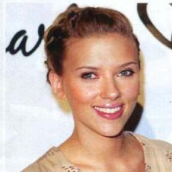
Scarlett Johansson, actress