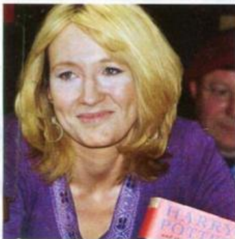
J. K. Rowling, writer