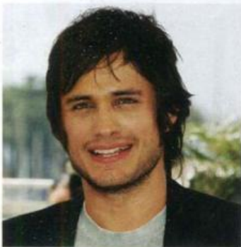
Gael Garcia Bernal, actor