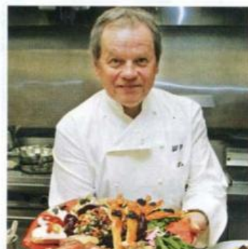
Wolfgang Puck, chef