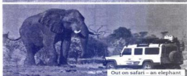
Out on safari – an elephant