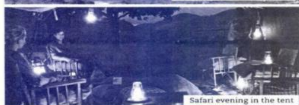
Safari evening in the tent