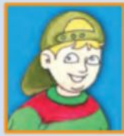
This is D avid.

Proper nouns always begin with a capital letter .