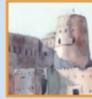
This is R ustaq F ort.