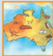
This is A ustralia.