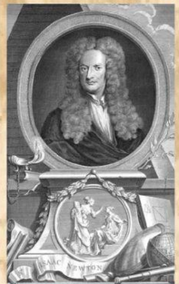
Sir Isaac Newton's tomb