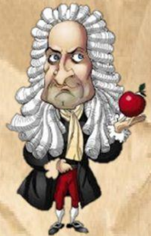
Sir Isaac Newton