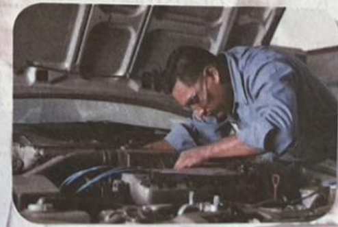
10. ....land scape 11. ....a tap 12. ....a car