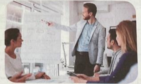
1. ....a photo 2.....ornaments 3. ....a chart