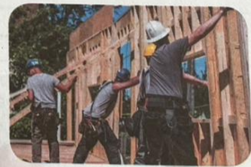
7. ....a blue print 8. ....a wood board 9. ....a house