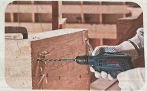
4. ....a room 5. ....a machine 6. ....a hole